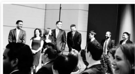
MSKCC fellowship graduation