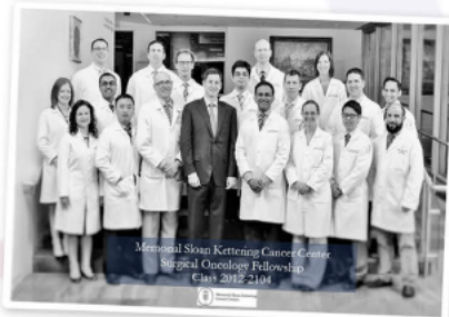
MSKCC Oncology fellows, Class of 2012-14